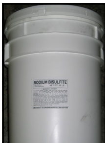
55 LB. PAIL